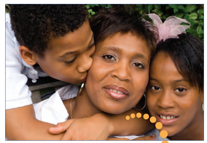
"I feel so validated when I talk to you, thank you for listening."

We offer services to victims of any age or gender-children, teens, adults, seniors-who have been threatened with physical, sexual, or emotional violence or other kinds of abusive, controlling behavior by someone in their lives.