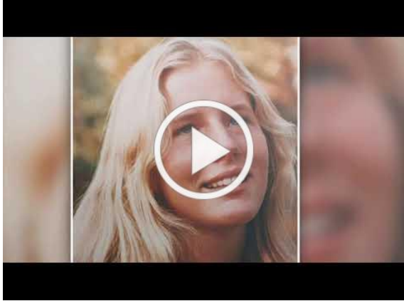
KNOW YOUR RIGHTS: MARSY'S LAW